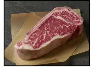
Indian Ridge Angus Bone-in Kansas City Style Strip Steak USDA Choice 1H1179**