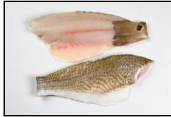
Copper Shoal Farm Raised Redfish Fillets (Skin on / PBO) SLRFPBO