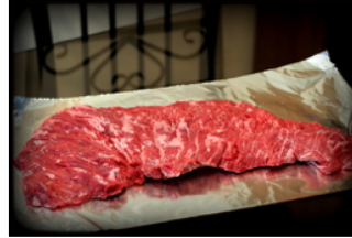
Churrasco Style Sirloin Steak USDA Choice Sizes: 6/7, 8/9, 10/11oz 1FCS*