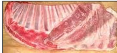
Colorado Lamb Breast 10lb case 213W