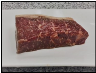
Wagyu Beef Petite Striploin Steak 7oz, 12 per case, frozen W51453