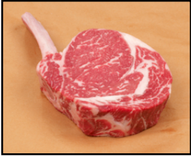
Authentic Cowboy Steak USDA Choice Sizes: 18/20, 20/22, 22/24oz 109CBSTK**