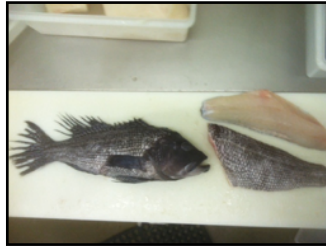
Atlantic Jumbo Black Bass Fillets (Skin-on / PBO) SBSBF