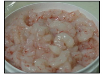
Peeled and Deveined Rock Shrimp (8 lb tub) SSHRS