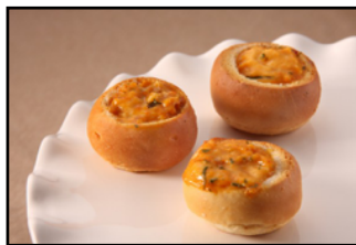
Saugatuck Kitchens Lobster Bisque Boule 60 count HDB103