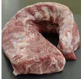
Spanish Iberico Boneless Pork Loin (lomo) 3lb avg. 3pc/cs 4PSI