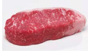
USDA Prime C/C Strip Steaks 1PRSS*