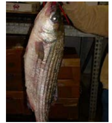
Wild Striped Bass (Rockfish) New York Legal Size Fish Skin On/ PBO SRF