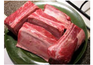
Portion-Cut Single-Bone Beef Short ribs 123S*