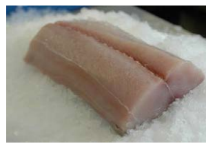
Wahoo Loins Skin On/ PBO SWL