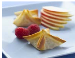
Saugatuck Kitchens Pear Roquefort Phyllo Star 200 ct. case HDF103