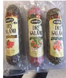
Busseto Salami Assortment three varieties, 2 ea. 8 oz. chubs; Black Pepper, Green Peppercorn, Herbs of Provence 6BASC