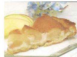
Hudson Valley Pear Apple Tart, un-cut, 10 inch, 2 per case FH2PAT10