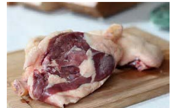
Champs d'Elise Magret Duck Leg Quarters, 18 lb. case 5DLM