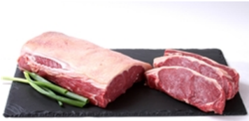
USDA Prime Whole Striploins 1PR180A