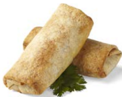
Van Lang Vegetable Spring Roll 200 ct. case HD101000