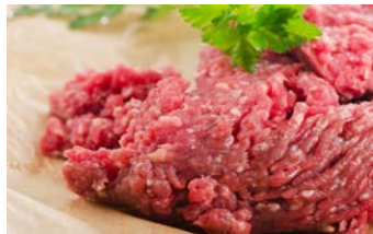
Texas Ground Wild Boar 10 lb. case, 4 ea. 2.5 lb. packs W31008