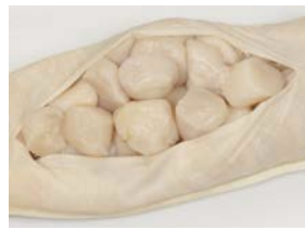
U10 Count Dry Sea Scallops SSEADU10