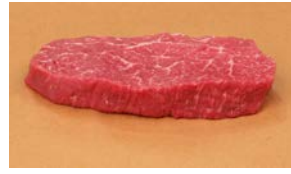
USDA Choice Coulotte "Pub" Steaks 1PUB*