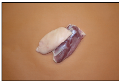
Crescent Farms Long Island Peking Duck Breasts 6/7 oz, boneless, skin-on, ABF 10 lb case, frozen 5BDB6/7