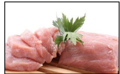
PA Proud Duroc Pork Tenderloin fresh, 10 lb case 4PA415A