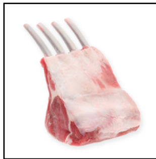
Ovation Farms of New Zealand 4-bone Frenched Lamb Rack Chops 10 oz, 2 racks per pack, 10 packs per case 204FNZ10