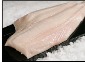
Large East Coast Day Boat Halibut Fillet skinless / PBO SHF