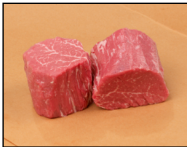
Petit Filet Mignon Prepared as Twin Filets, Mixed Grill, or Surf and Turf, these versatile steaks are money makers 1FTS4, 4 oz 1FTS5, 5 oz