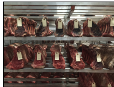
Dry Aged Boneless Striploin Aged 28-Days or longer in our Dry Age room, these steaks are a great high-end feature 1DA180A 1DA180AC, Cut to Order