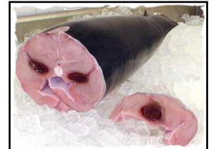
Domestic Mako Shark Loins skin-on / PBO SMSL