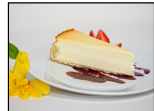
Hudson Valley Bakery New York Cheesecake 2 per case FH3NYC10