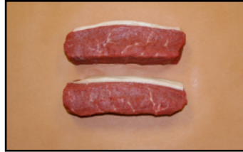
Hacienda Style Coulotte Steak USDA Choice Sizes: 6/7, 8/9oz 184DH*