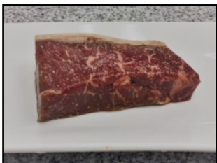
Wagyu Beef Petite Striploin Steak 7oz, 12 per case, frozen W51453