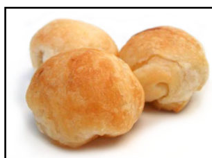
Van Lang Apricot Brie en Croute 200 count HD231100