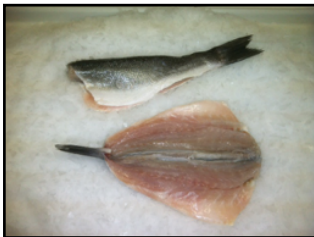
Farm Raised Butterfly Bronzino (head off / PBO, 7/9oz portions) SBWFB