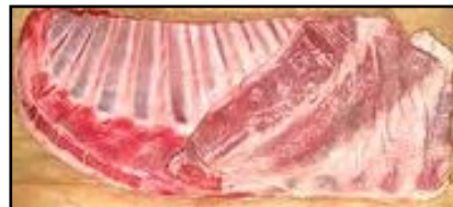
Colorado Lamb Breast 10lb case 213W