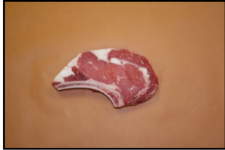
Butcher Style Cowboy Steak USDA Choice Sizes: 18/20, 20/22, 22/24oz 109CBSTK**