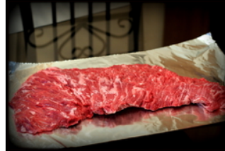
Churrasco Style Sirloin Steak USDA Choice Sizes: 6/7, 8/9, 10/11oz 1FCS*