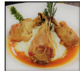
Chicken Drumstick Osso Bucco 5/6oz each, 10lb case, frozen WCOB