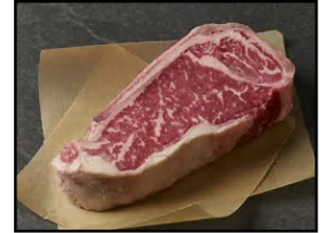
Indian Ridge Angus Bone-in Kansas City Style Strip Steak USDA Choice 1H1179**