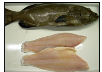
Atlantic Black Grouper Fillets (skinless / PBO) SGF