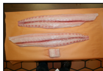
Large Mahi Fillets Skin-on / PBO: SMM Skinless / PBO: SMMBS