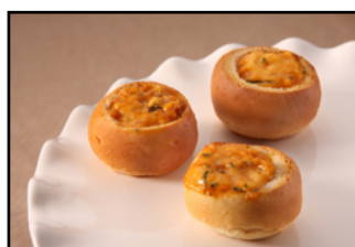
Saugatuck Kitchens Lobster Bisque Boule 60 count HDB103